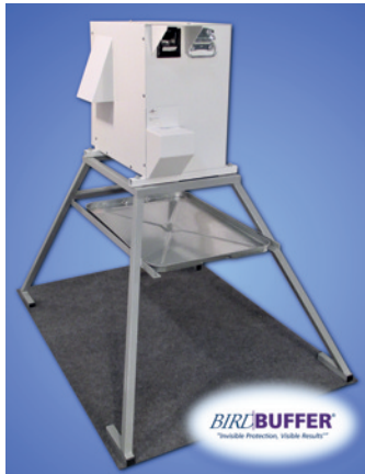
BirdBuffer Q3® on Stand #820064