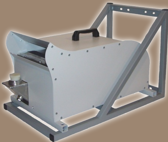
Shown on optional mounting bracket #820062