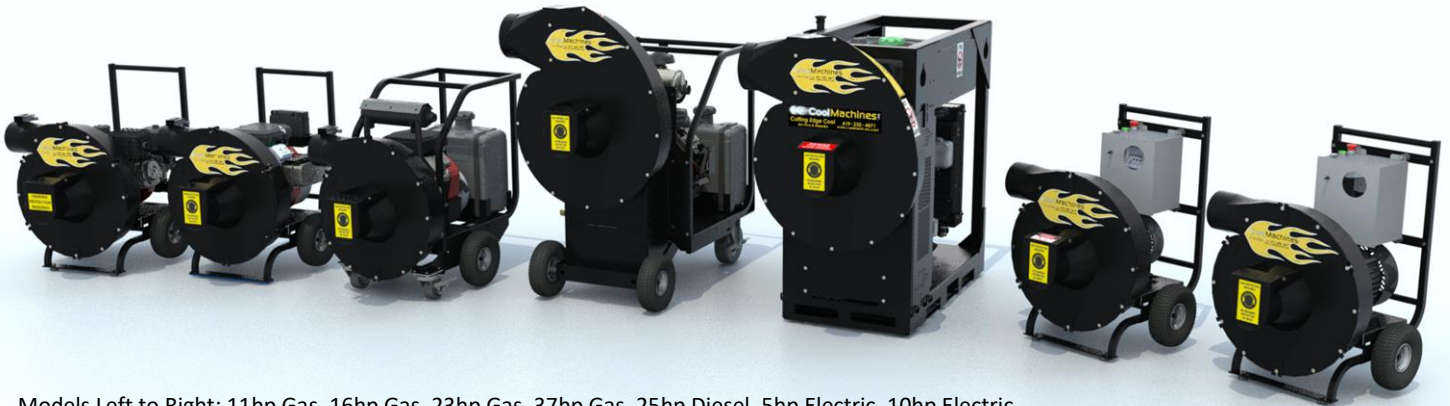
Models Left to Right: 11hp Gas, 16hp Gas, 23hp Gas, 37hp Gas, 25hp Diesel, 5hp Electric, 10hp Electric